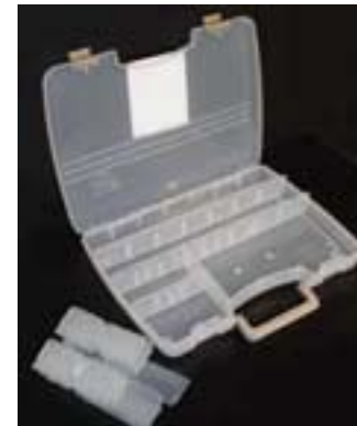
ProLatch organizer tray