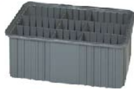
Removable drawer with adjustable dividers