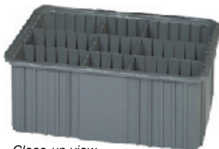
Close-up view Drawer with adjustable dividers