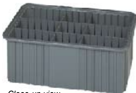
Close-up view Drawer with adjustable dividers